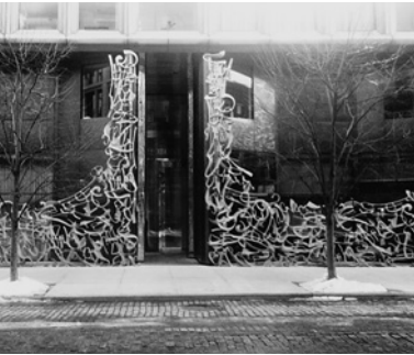
40 Bond Street, New York (Herzog & de Meuron)

one reason why the architects had a bizarre structure raised between the street and the building itself—it looks like a mixture between a fence and sculpture and is, in fact, both: a barrier against the real bohemian world of the punks and an emblem of the perceived underground affiliation of the new tenants, who are paying steep prices for the luxury apartments in this building (according to the industry information service “The real deal,” the monthly rent is said to be well above $20,000).