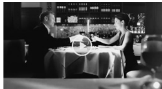
Advertising for the Kronprinzengärten complex in Berlin

Cut: we see the new residential quarter where the woman lives: white façades, muntined windows, green blinds, boxwood trimmed in a round ball shape, the architecture looking as if the architect added some whipped cream-like plaster around the boring flan case to make the whole look a little more like Art Deco. Oddly, a carriage is parked in front of the house; the woman seems to be hosting a just defrosted Alexander von Humboldt.